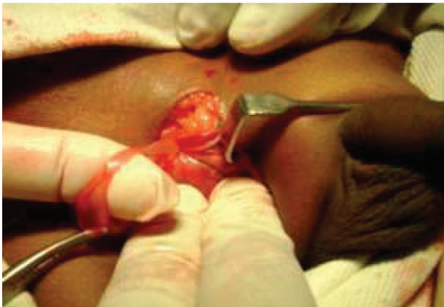
Figure 3a: Dissection of hernia sac during open procedure.