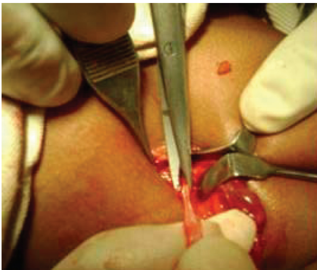
Figure 3b: Excision of hernia sac.

suture with 3-0 or 4-0 vicryl. Sterile dressings were then applied.