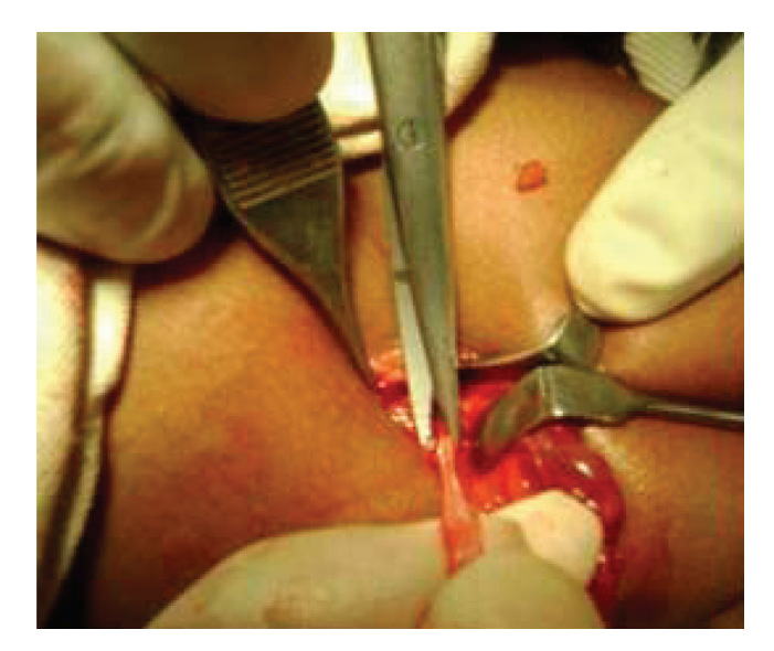
Figure 3b: Excision of hernia sac.

suture with 3-0 or 4-0 vicryl. Sterile dressings were then applied.