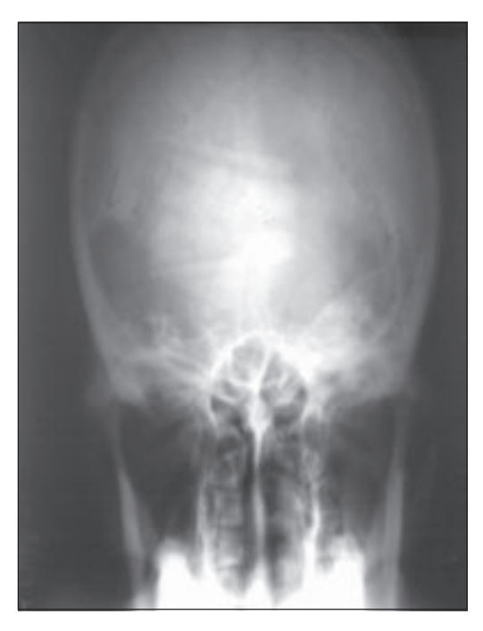
Figure 3: Osteolytic lesion in right temporal bone.