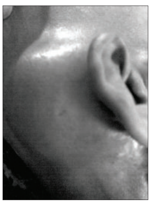
Figure 1: Post-auricular swelling.

her build was average and mildly anaemic. On systemic examination all findings are normal. On local examination of right ear, blood stained mucopurulent discharge was present in external auditory canal. Tympanic membrane was destroyed and there was a red fleshy mass in middle ear which bleeds on touch. There was a round swelling about 3 cm in size over right mastoid process, non tender, fixed and firm in consistency. Lower motor neuron type of facial nerve paralysis was present on right side. Tuning fork tests revealed conductive deafness in right ear. No abnormality was detected in left side. On examination of neck, there was a small, hard and non tender nodule less than 1 cm in size in lower part right lobe of thyroid gland. The patient was totally unaware about this nodule. Cervical lymph nodes were not palpable. In laboratory investigations, her Hb was 11 gm%, TC, DC, urea, creatinine, blood sugar all were within normal limit. X ray chest and ECG were also normal. X ray mastoid Towne's view