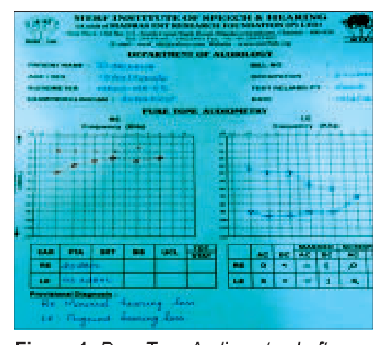
Figure 1: Pure Tone Audiometry: Left ear – Profound hearing loss.

Clinical examination showed normal otoscopic findings with absence of ipsilateral wrinkling of forehead (grade IV). Tuning fork tests were suggestive of unilateral (left-sided) sensorineural hearing loss. Audiological tests included pure tone audiogram which revealed profound hearing loss in the left ear and normal hearing in the right ear. Impedance showed 'A' type tympanogram bilaterally. Otoacoustic emissions were absent on the left side. Electrophysiological studies showed no indication of retrocochlear pathology. Videonystagmography was normal except for the caloric test which showed hypoactive left labyrinth.