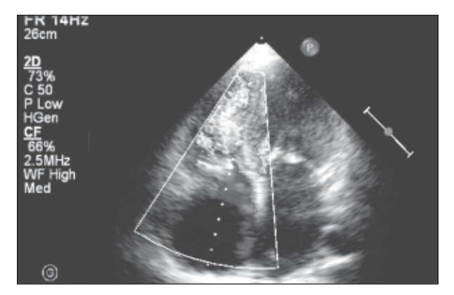
Fig.-3: Tricuspid Stenosis