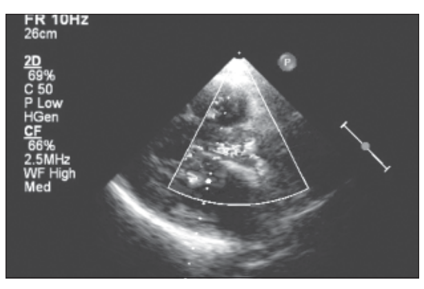
Fig.-2: Aortic regurgitation