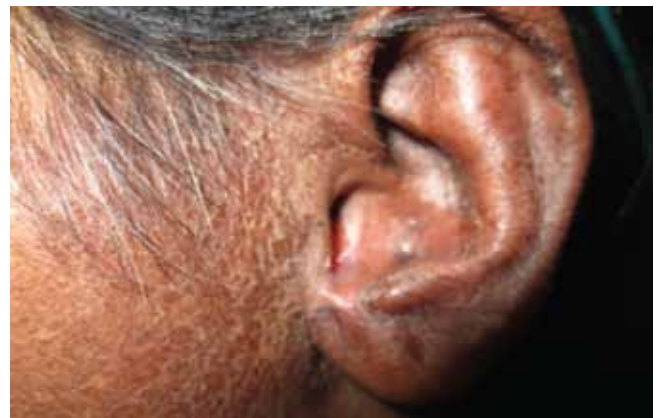
Fig 3: After surgery and radiotherapy (6 months)