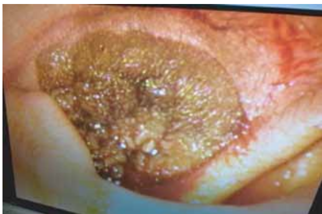
Fig 1: Preoperative photograph of external auditory canal (under microscope)

This is the presentation of a 45 years old woman who came to the ENT and Head Neck Surgery department of Delta Medical College, Dhaka, Bangladesh with a mass in left ear with discharge and impairment of hearing on the same side for 7 years. She was treated by some topical and systemic antibiotics on several occasions previously. Otoscopic examination showed a mass occupying almost whole of the external auditory canal and the overlying skin was thickened, papillary and blackish. Cytology from external auditory canal scrap showed hyperkeratosis and parakeratosis. External auditory canal bone was found eroded at some parts during surgery. Excision of the external auditory canal mass was done under general anaesthesia. Whole skin from external auditory canal was excised under microscope. The eroded bony part was made smooth using microdrill. Split thickness skin was taken from anterior aspect of left thigh and grafting was done in external auditory canal. The whole of the specimen was sent for histopathological examination which revealed it as verrucous carcinoma.