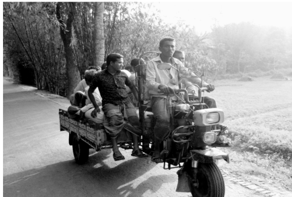
Photograph: A 'Nasimon' on the village road