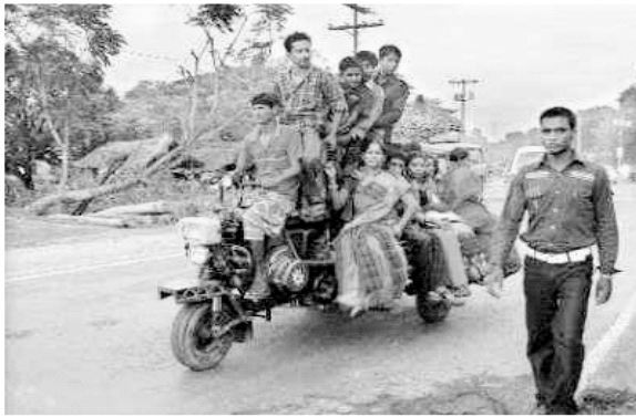
Photograph: A 'Nasimon' on the highways