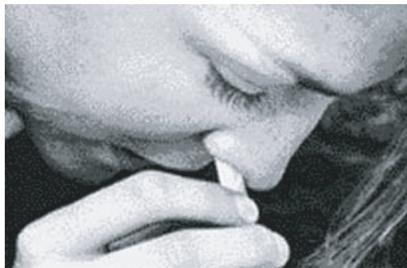
Figure-2: Drug Addiction

Methamphetamine in all forms is very dangerous and has a high potential for abuse and dependence. Moderate to chronic use of yaba and other methamphetamines may lead to physical and psychological dependence and even death 8 . Tolerance can develop with chronic use. In an effort to intensify the drug's effects, users may take higher doses of the drug, take it more frequently, or change their method of drug intake. Some abusers may forego food and sleep while on a "run". A run consists of the injection of as much as a gram of the drug every 2 to 3 hours over several days until the user runs out of the drug or is too disorganized to continue. When an individual goes through withdrawal from high doses of yaba, as well as other forms of methamphetamine, severe depression other results 9 .