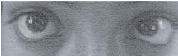
Fig.-1: At presentation, right sided 6 th nerve palsy during right lateral gaze without any affect on left lateral gaze.

Routine laboratory investigations of CBC, ESR, Hb% and Urine R/M/E were normal. Inflammatory markers were also normal. CSF study showed all the parameters are within the normal limits. Neuroimaging with CT head, MRI and MRA were also done to exclude any demonstrable pathology and all results were normal.