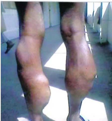
Fig-1: Subcutaneous lesions on both legs

FNAC of the left forearm and leg swellings were done in the pathology department of Rajshahi Medical College. But the reports were inconclusive. Subsequently a moderate size lesion over the left forearm was excised completely and was sent for histopathological examination. Histopathology report revealed multiple mature and immature cysts (sporangia) packed with spores. There were chronic inflammatory cells infiltrating into normal tissue. The histopathological diagnosis was rhinosporidiosis.