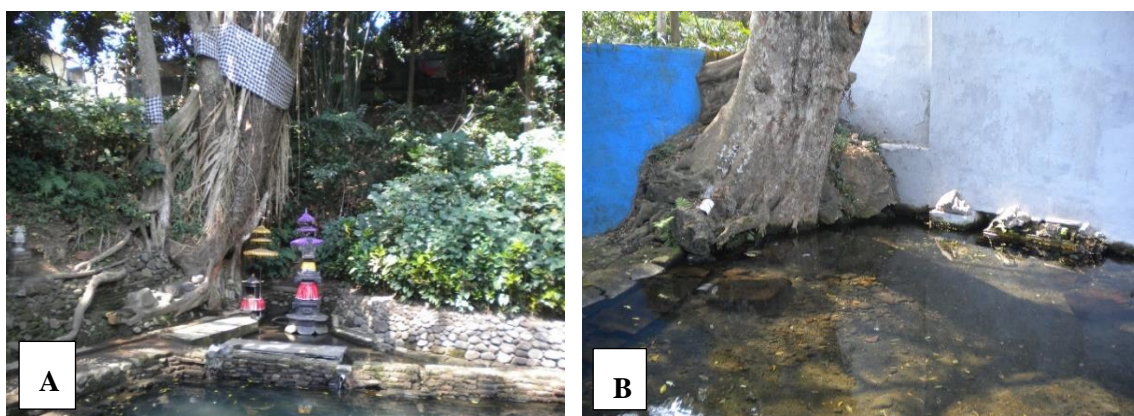
Figure 2. A. Sumber Watu Gede Petren in Singosari District. B. Wendit water spring under lo tree ( Ficus glomerata ).

The petren area in Malang regency with its spring turned out to have a very important role namely: a. preserving traditional knowledge; b. possessing high ecological conservational value; c. preserving cultural diversity, d. possessing local religious values and beliefs; e. preserving species, genetic of local plants; f. serving as the construction area of the Regional Water Company (PDAM); g. becoming the area for factory and housing development; h. supporting the irrigation for cultivating plants, and i. serving as the proponent of education and ecotourism. Perceptions, conceptions, information, and changes about the meaning of petren need to get attention in supporting traditional conservation. This traditional conservation in the form of springs and their environment or petren has been maintained by local communities themselves and has a more long-term and sustainable meaning (Figure 2). The community has tried and been able to preserve these springs through the preservation of various species of Moraceae family trees such as lo ( Ficus glomerata ), ringin ( Ficus benyamina ), ilat-ilat ( Ficus callosa ), ipik-ipik ( Ficus procera ) and other various types of supporting trees such as bamboo species. Local people have been able to choose and determine the type of tree that has long life and a sacred meaning which is used as an effort to preserve water springs.