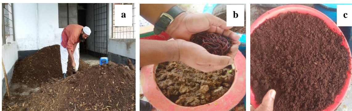
Figure 1. a) Turning operation in composting b) addition of earthworm in vermicomposting pit c) finished vermicompost.

A total of 3 concrete pits, locally called chari was used to prepare vermicompost (T 2 ). The chari/pits were semicircular in shape having a diameter of 0.5 meter and a height of 0.3 meter. Approximately 30 kg manure was put in each chari/pit and a total of 90 kg cowdung was needed for this vermicomposting operation. There is a rich breeding stock of red worms in the farm section of waste recycle and renewable energy laboratory of Department of Animal Science, BAU. Red worm was collected and stored in appropriate breeding condition previously before setting the vermicomposting operation. All 3 pits were cleaned and 30 kg raw cow dung was added in each chari. About 100 g red worm was put on the surface of each chari and then covered the chari with straw after disappearing the worms (Figure 1b). The initial ambient temperature was 25°C and the approximate moisture was 75% for easy movement of the worms.