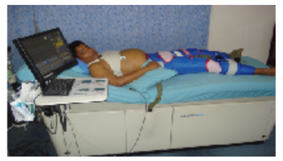
Fig 2: Patient receiving EECP therapy in a center at Dhaka.