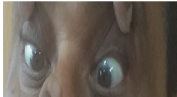
Fig.-4: Normal left gaze movement

On ocular examination following significant findings were found: