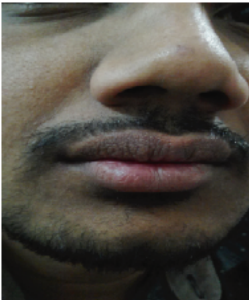
Fig-1: flat topped pinhead sized skin colored popular lesions over both upper and lower lips.

The patient was treated with Pimecrolimus cream twice daily for 3 months and then once daily for further 3 months. After a month he had marked improvement of symptoms. By 3 months, the papules had flattened. The lesion found absent on follow up nine months after completing therapy.