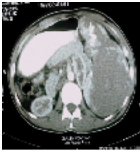
Fig: CT scan of the whole abdomen revealed huge splenomegaly with multiple SOL.