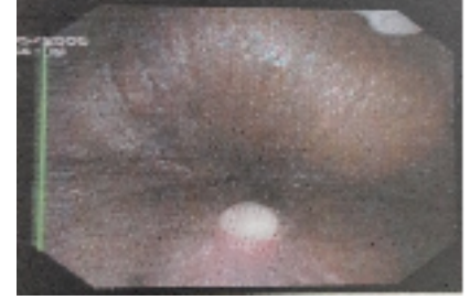
Fig-7: anal abess