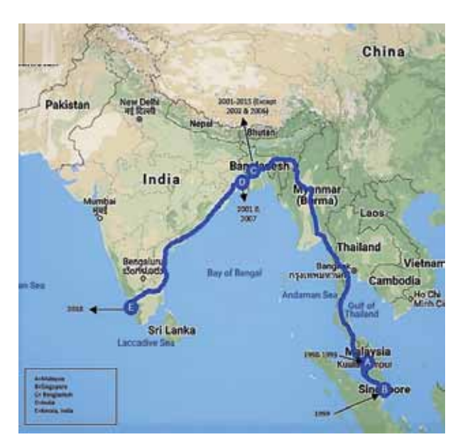
Figure 1: Trail of Nipah virus infection in South East Asia Region.