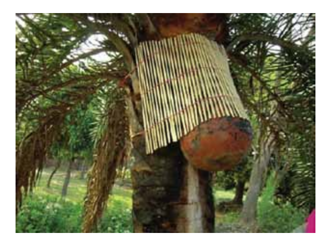
Figure 3: Bamboo skirt method to block fruit bats contamination date palm sap.

Most of the patients who had presented with acute meningo-encephalitis had died by the time a diagnosis was made, which creates difficulty to isolating the case and build up strategies to prevent nosocomial transmission.<sup>29</sup> The physician and health caregiver in such settings are more vulnerable to Nipah infection as they are attending emergency outdoor patients without wearing personal protective equipment (PPE) because of their unawareness of impending outbreak.<sup>30</sup> But, these tendencies have been greatly reduced after mass awareness campaign and training program run by government.