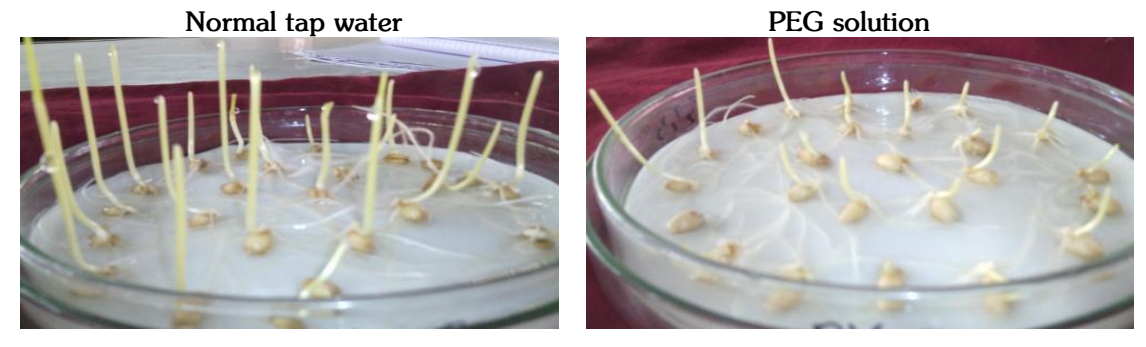
Fig. 1. Seven days old seedlings of wheat genotype grown under normal tap water and PEG solution.

found in BARI Gom 28. Under stress condition, BAW 1177 produced the highest shoot length (2.72 cm) followed by BARI gom 28 (2.19 cm), while BARI Gom 29 had the lowest shoot length (1.36 cm) which was statistically identical with ESWYT 29 (1.37 cm).