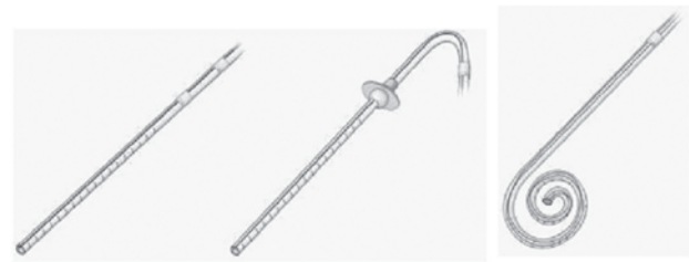
Straight (used in the study) Swan-neck Coiled

Statistical Package for the Social Sciences (SPSS) version 20.0 was used to analyze data. Quantitative data were analyzed by mean and standard deviation from the mean and qualitative data were expressed as frequency with corresponding percentage.