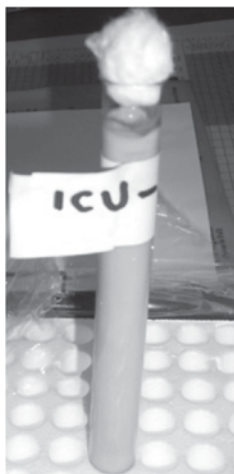
Fig 2 : Fine needle aspiration material from the swelling

Laboratory investigations showed Hb 8.6mg/dl, ESR 100 mm/1st hour, Urea 173mg/dl, S. Creatinine 9mg/dl, X-ray chest unremarkable; Blood, Urine and Tracheal Aspirate C/S revealed no growth, T/A for AFB not found. CSF study including ADA normal. With the consent of the party, we did FNA from scalp swelling, which showed pus (Fig 2) and histopathology revealed few aggregates and scattered epithelioid cells along with many polymorphs, lymphocytes as well as histiocytes; compatible with abscess (Fig 3); possibility of TB cannot be ruled out.