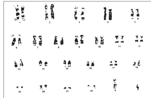
Fig 2: Karyogram showing both male 46, XY (above) and female 46, XX (below) Karyotype in same patients.

We also did Y chromosome analysis by Quantitative fluorescence- PCR. There we found normal Y chromosome and no evidence of micro-deletion at AZFa, AZFb, AZFc and SRY region of Y chromosome (figure-3).