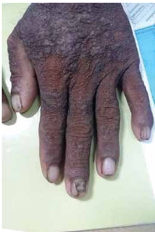
Fig 2: Nail involvement showing v-shaped notches with fragility and longitudinal red and white lines.