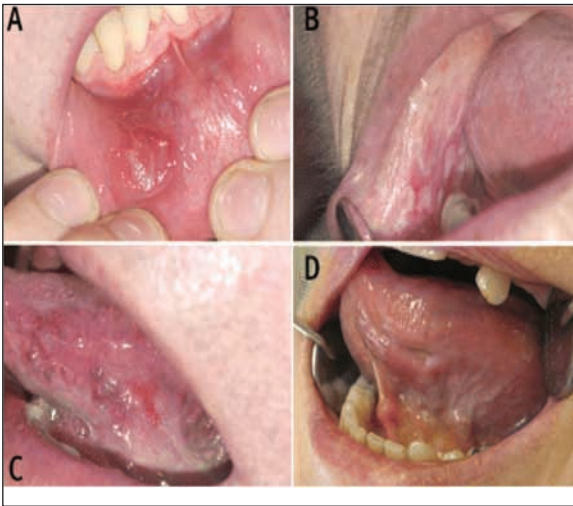
Fig 2. Chronic non-neoplastic ulcers. (A) Major aphthous ulcer of the lower lip. (B) Erosive oral lichen planus with bullous formation and ulceration of left cheek mucosa. (C) Oral ulceration secondary to oral lichen planus healing with granulation tissue visible at ulcer base. (D) Ulcer on lateral tongue caused by nicorandil.

oral and genital involvement. Oral lichen planus may occur as an isolated entity. The ulceration is typically superficial, often described as erosion, and blends with surrounding inflamed tissue. Fine white striae represent keratosis. The ulcer may be associated with desquamative full thickness gingivitis. The differential diagnosis for such widespread ulceration includes rarer causes such as systemic lupus erythematosus, graft versus host disease, and immunobullous disorders (mucous membrane pemphigoid and pemphigus vulgaris).