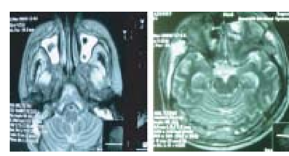
MRI of Brain