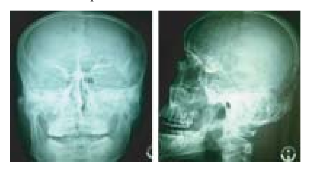
X – Ray Skull AP and Lateral view

X-Ray Skull showed multiple lytic lesions and Immunoelectrophoresis: Normal