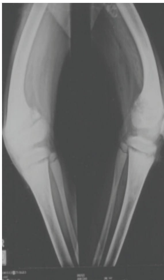
Figure 2. X-ray of left knee joint including lower half of femur & upper half of tibia and fibula shows metaphyseal dysplasia in the lower end of femur, both tibia and fibula. Bowing of both femur (Coxa vera) deformity noted.