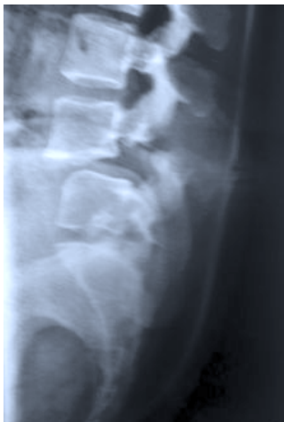
Figure 1. Preoperative x-ray A-P and lateral view of lumbosacral spines showing spondylolisthesis of L4 over L5.