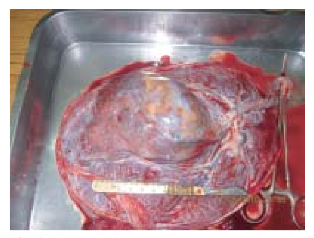
Fig.-1: Placental chorioangioma from fetal surface of placenta.

thrice daily for 7 days and was discharged from the hospital with the advice of daily kick count. She came back to Gynae outpatient department with complaints of less fetal movement. Cardiotocography and biophysical profile was normal. Ultrasonography showed increased size of mass measuring 8x9 cm. Lower segment caesarean section was done at 37 weeks and had delivery of a female baby with normal Apgar score and birth weight of 2.7 kg. Placenta was delivered by controlled cord traction and sent for histopathology. Macroscopically, the placenta was 22x18x6.5 cms and weighed 1100 grams. There was a large well circumscribed lesion near the attachment of cord seen from the fetal surface of the placenta measuring 12x9x7.5 cms [Fig-1]. On sectioning this consisted of multiple dialated vascular channels. Areas of haemorrhage and necrosis were seen. Histopathology confirmed chorioangioma [Fig-2]. Both the mother and the baby were discharged in good condition following delivery.