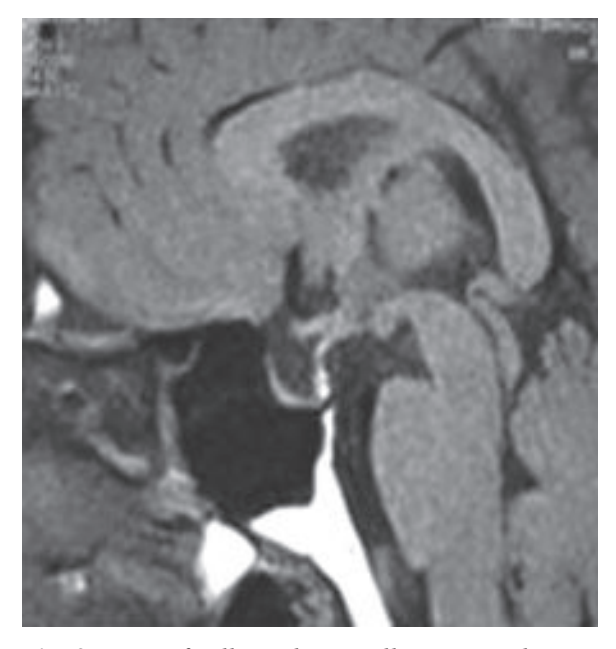
Fig.-2: MRI of sella and parasellar region showing empty sella.

After considering all the clinical parameters and investigation reports we concluded that this prematurely