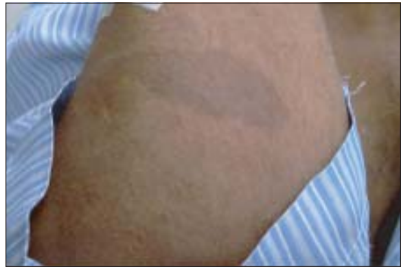
Patch on forearm