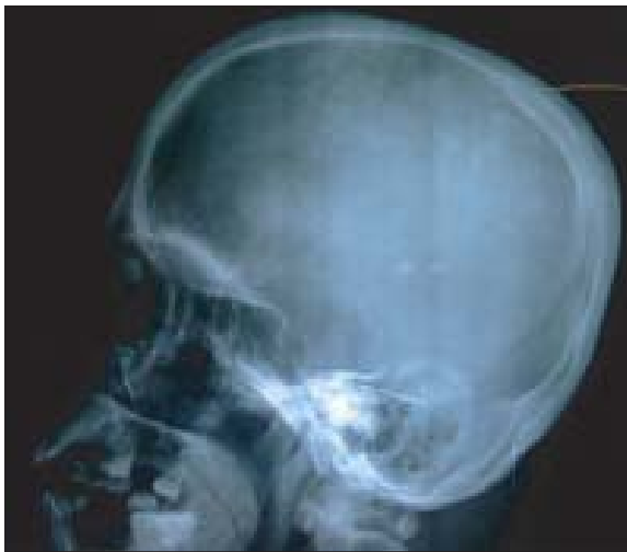
X-ray skull (Lateral view)