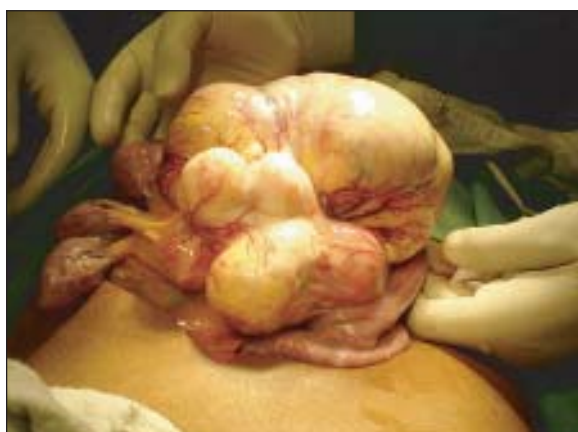
Fig.-3: Per operative view

Abdomen was opened by midline incision. The lump was delivered through the wound ( Fig 3). It was a large multiloculated solid tumour in between the two leafs of the mesentery & also adherent to the mesenteric border