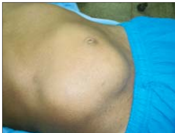
Fig.-1: Before operation

haemoptysis, jaundice or any bone pain. On examination, his all general & vital parameters were normal. On abdominal examination, there was an elliptical, non-tender, firm lump in the abdomen measuring about (14 × 7) cm (Fig.-1). The overlying skin & underlying structures were free, margins were well defined, surface was irregular. The swelling was mobile in all direction & did not move with respiration.