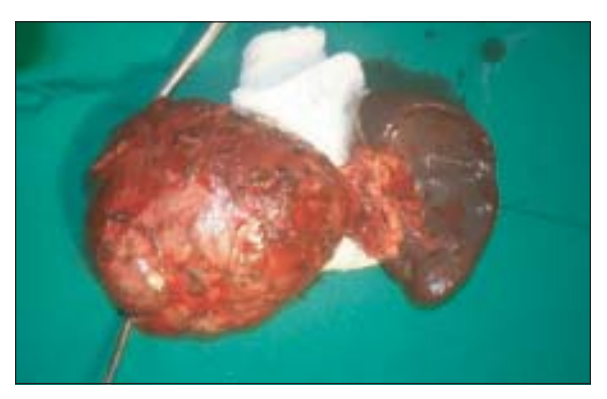
Fig.-3: Tumour removed en-mass with Spleen