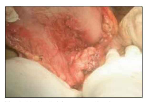
Fig.-4: Distal end of the pancreas closed

Postoperative period was uneventful except, minor wound infection. The wound swab culture isolated Acinetobacter infection sensitive to Colistin. It was managed by surgical debridement & dressing and the antibiotics offered according to culture & sensitivity of wound swab. Her glycaemic status was normal (5.7 –