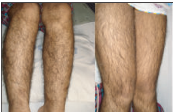
Fig.-2: Increase growth of hair in lower limb of the study case.

On general examination hirsutism was present. Her breast development was normal, external genitalia and pubic hair is of normal female type. There was mild clitoromegaly.