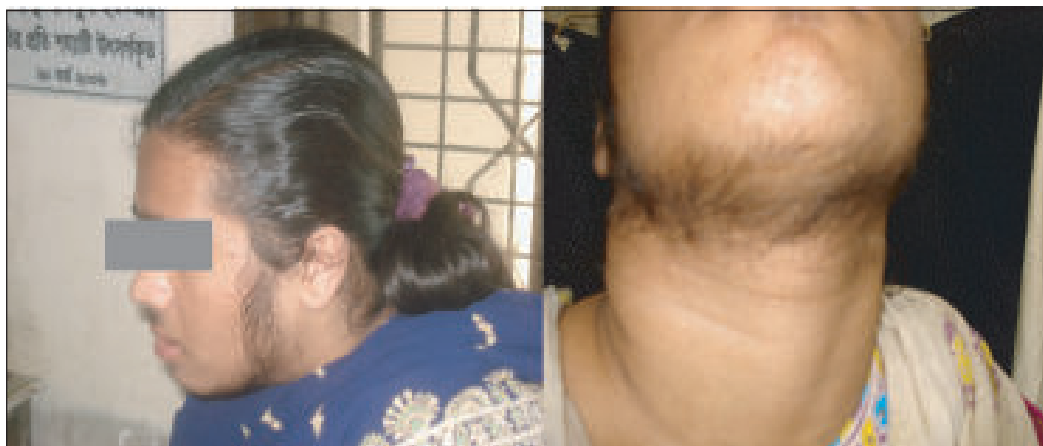
Fig-1: Hirsutism and frontal balding in the study case

A 15 years girl was admitted with absence of menstruation and increase growth of facial and body hair for 2 years along with change of voice for 6 months. She attained her menarche 3 years back at the age of 12 years. Her menstrual cycle was irregular since beginning. She had only 3 cycles in 1st year after menarche. Later on she became amenorrhic. She visited a gynecologist who advised tab. progesterone but there was no withdrawal