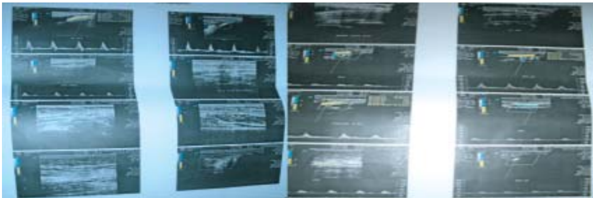
Fig-1: duplex scan of right lower Lower Limb Arterial System