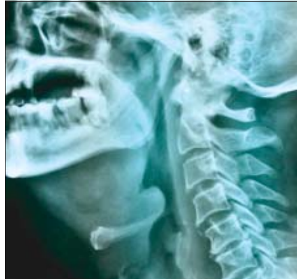
Fig-2: Thumb-print sign due to swollen, inflamed epiglottitis.

discouraged as it may provoke airway spasm. Therefore, diagnosis is made on the basis of direct fiber-optic laryngoscopy carried out in operating room. On lateral cervical spine X-ray, the thumbprint sign (or 'thumb sign') describes a swollen, enlarged epiglottis 2 , usually with dilated hypo-pharynx and normal supra-glottic structures.