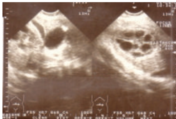
Figure 1. Ultrasonogram showing hepatic cyst with septation

Haematological parameters revealed eosinophilia (8%). Abdominal ultrasonography revealed multiple cystic lesions of variable size in liver, spleen, right adrenal gland and left ovary (Figure 1). Computed tomographic (CT) scan showed multiple cystic lesions with septation in liver, spleen, pancreas and mesentery suggesting hydatid disease (Figure 2). Echinococcus serology done by haemagglutination assay (HA method) was positive at 1:2560 dilution. Hepatic and renal biochemistry including serum electrolytes were within normal range. HbA1c was 8.9% and fasting blood glucose 7.8 m.mol/L.