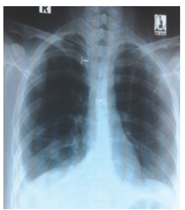
Figure 1 X-ray Chest PA view showing bilateral pleural effusion

neutrophil, 5% lymphocyte, no malignant cell), albumin 27 gm/L, SAAG 7 gm/L and normal glucose, ADA, amylase level.