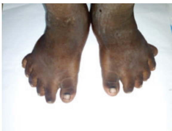
Figure 2 Polydactyly of both feet