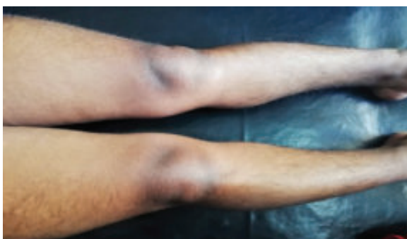
Figure 2 Excessive hair growth in thigh

Chromosomal analysis showed a normal female 46XX karyotype. Ultrasonography showed normal uterus and bilateral ovaries (right 4.2 cc and left 5 cc). There was no detectable ovarian or adrenal mass. X-ray for bone age was 15 years suggestive of bone age advancement indicates pseudo prepubertal puberty. The diagnosis of non-classical congenital adrenal hyperplasia was suspected clinically and based on biochemical findings. S. Testosterone, DHEA-S, 17 \alpha hydroxyl-progesterone (17 \alpha -OHP), an intermediate product in the biosynthesis of cortisol was marginally elevated (Table I) and further increased after short Synacthen test, but S. cortisol was not increased (Table II).