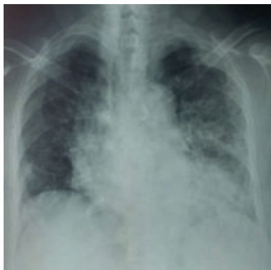
Figure 1 Chest x-ray postero-anterior view showing bilateral pulmonary involvement by SARS-CoV-2 infection