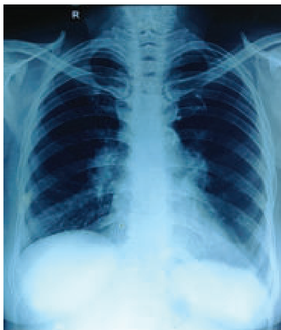
Figure 3 Chest x-ray postero-anterior view showing bilateral hilar lymphadenopathy

Her laboratory investigations including routine urinalysis, renal function tests, serum electrolytes, calcium, magnesium and electrocardiogram were normal. Glycated hemoglobin (HbA1c) was high (8.4%). Full blood count with erythrocyte sedimentation rate (ESR) showed lymphopenia and high ESR. Her chest x-ray showed bilateral hilar lymphadenopathy (Figure 3).