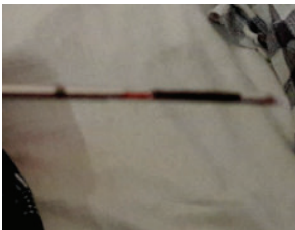
Figure 1 Tru-Cut needle containing black hepatic tissue

Liver biopsy was performed with a Tru-Cut needle to confirm the diagnosis. On macroscopic examination, marked black discoloration of the hepatic parenchyma was seen (Figures 1, 2). Microscopic preparation showed normal liver architecture and dark-brown pigmented granules within the cytoplasm of hepatocytes with routine haematoxylin and eosin (H&E) staining (Figure 3). The pigmented granules were positive with Masson-Fontana staining (Figure 4) but negative with peroxidic acid-Schiff (PAS), periodic acid-Schiff-diastase (PAS-D), Masson's Trichrome , iron and reticulin stain. No evidence of steatosis, granuloma, cirrhosis or atypical cells was seen. Based on the clinical history and histopathological findings of the liver biopsy, a diagnosis of Dubin-Johnson syndrome was made. Since no treatment is required in this condition, no specific treatment was given.