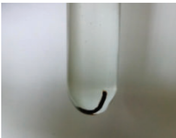
Figure 2 Test tube containing black hepatic tissue