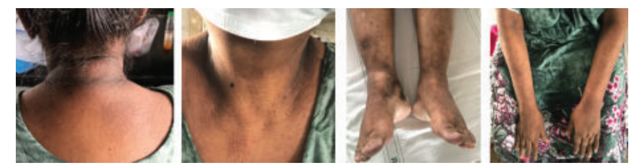
Figure 1 Grade IV acanthosis nigricans (a) and hyperpigmentation in limbs (b)

She recovered her senses after intravenous infusion of 25% dextrose. She had no relevant medical or family history. Patient denied any use of exogenous insulin or oral hypoglycemic agents.