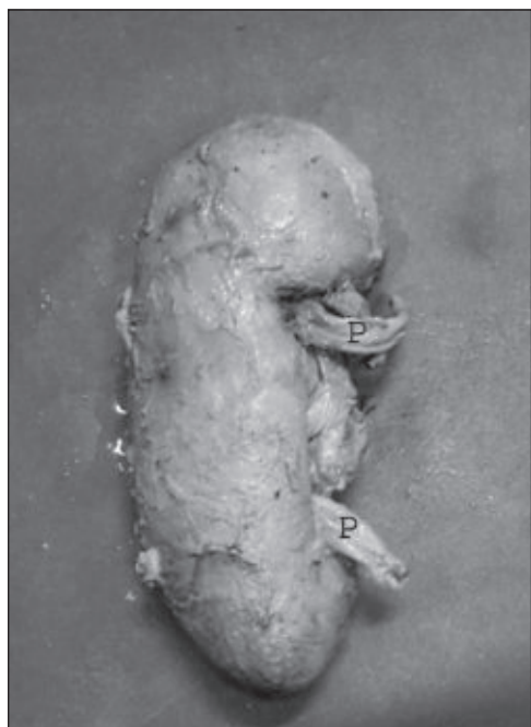
Fig.-4: Showing the double renal pelvis (P = Pelvis).