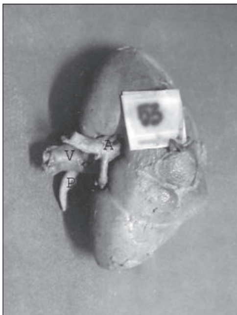
Fig.-3: Showing the renal artery anteriorly (V = Vein, A = Artery, P = Pelvis).