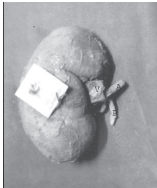
Fig.-2: Showing the typical arrangement of structures at hilum of kidney (V = Vein, A = Artery, P = Pelvis).