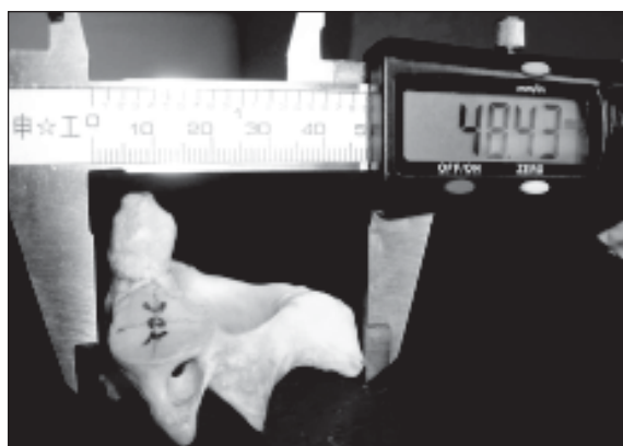
Fig.-1: Photograph showing the measurement of sagittal length of second cervical vertebra by using digital slide calipers. The dot in the body indicates most anterior point of it and the dot in spinous process indicates most posterior point of it.

Afterwards for the measurement of sagittal length of second cervical vertebrae, the most anterior point of the body and the most posterior point of the most projecting part of bifid spinous process of second cervical vertebrae were determined. A red dot was given on the most anterior point of the body of second cervical vertebra. Another blue dot was given on the most posterior point of spinous process. Then sagittal length of second cervical vertebra was measured as the distance between the two determined points with the help of digital slide calipers and the reading was recorded (Fig.-1).