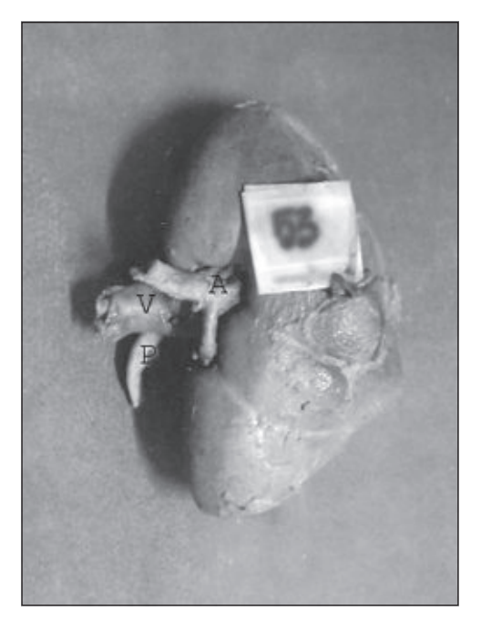
Fig.-3: Showing the renal artery anteriorly (V = Vein, A = Artery, P = Pelvis).