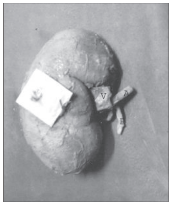
Fig.-2: Showing the typical arrangement of structures at hilum of kidney (V = Vein, A = Artery, P = Pelvis).