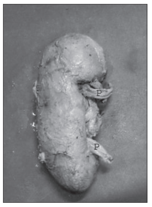
Fig.-4: Showing the double renal pelvis (P = Pelvis).