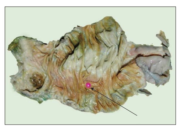
Fig.-2: Showing location of major duodenal papilla marked by arrow in the posteromedial wall of the second part of the duodenum