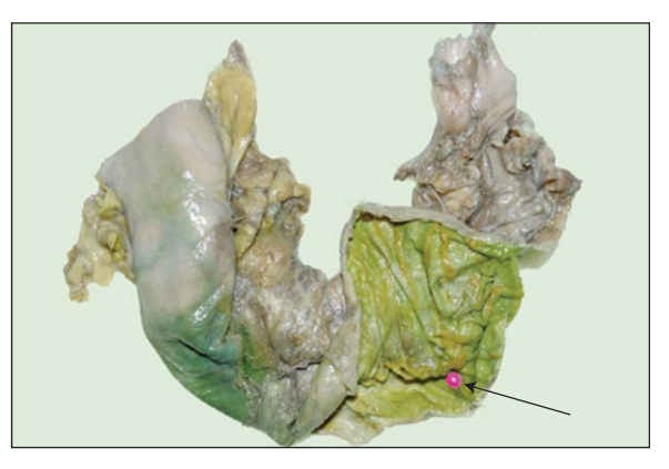
Fig.-3: Showing location of major duodenal papilla in the posteromedial wall in the junction between second and third part of the duodenum marked by arrow