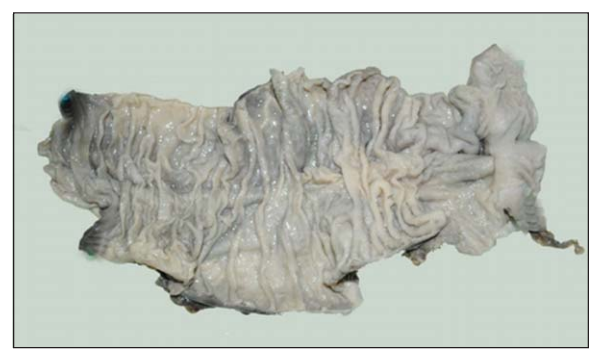
Fig.-4: Showing absence of major duodenal papilla in the duodenum