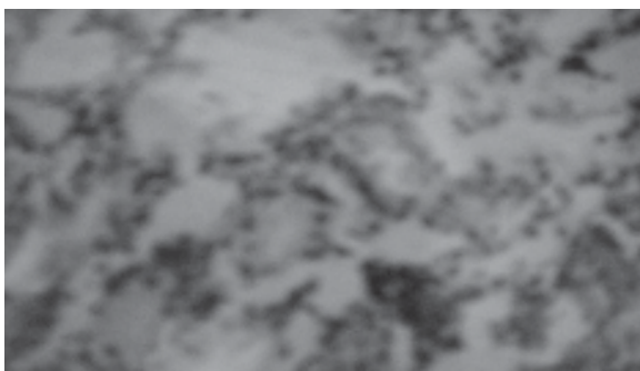
Fig.-3: A high power (X100) photomicrograph showing proximal tubular necrosis of kidney in gentamicin treated rats (100 mg/day)