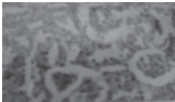
Fig.-2: A high power (X100) photomicrograph showing proximal tubular necrosis of kidney in gentamicin treated rats (50 mg/day)