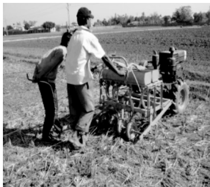
Fig. 1. Zerp till-drill