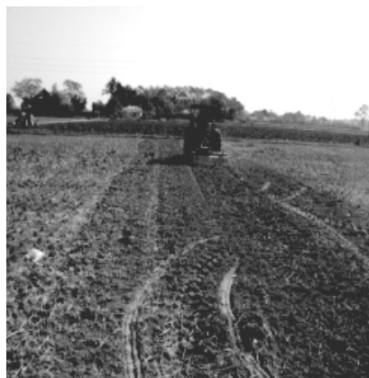
Fig. 4. Farmer's practice (FP)