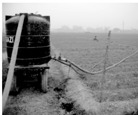
Irrigation water (IR) supply