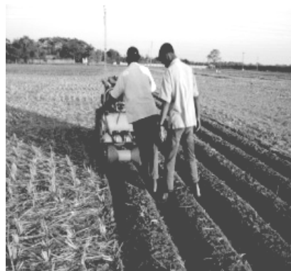
Fig. 2. Bed planting