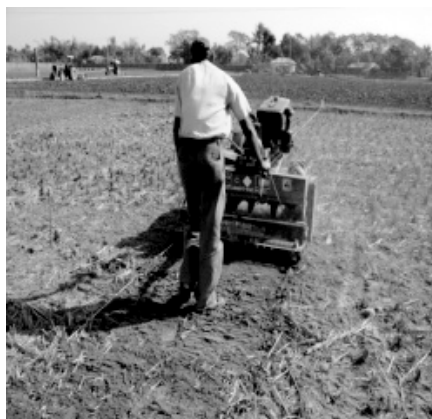
Fig. 3. PTOS