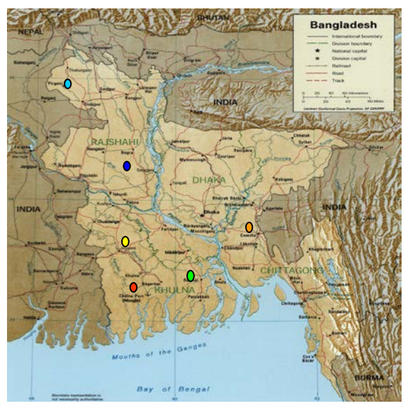
Figure 1. Map of Bangladesh showing study areas

(Comilla) and Sylhet area. A total of 24 samples were collected from different producers from those areas. The samples were brought to the laboratory in a thermo flask and were maintained at low temperature by use of an ice box until analysis and were analyzed.